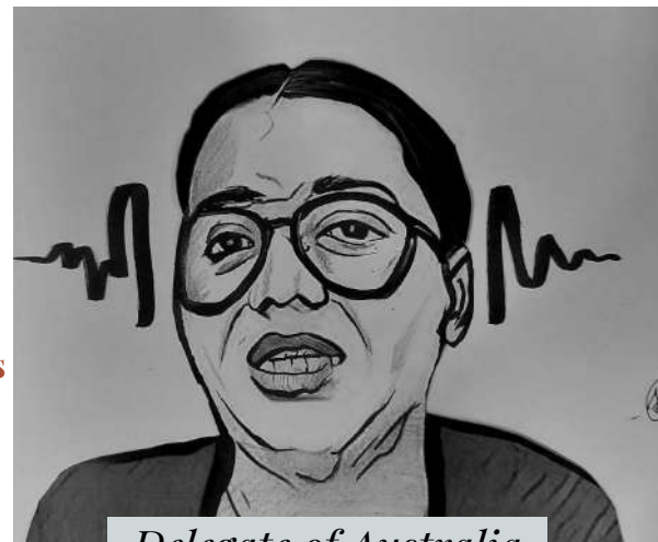
Delegate of Australia