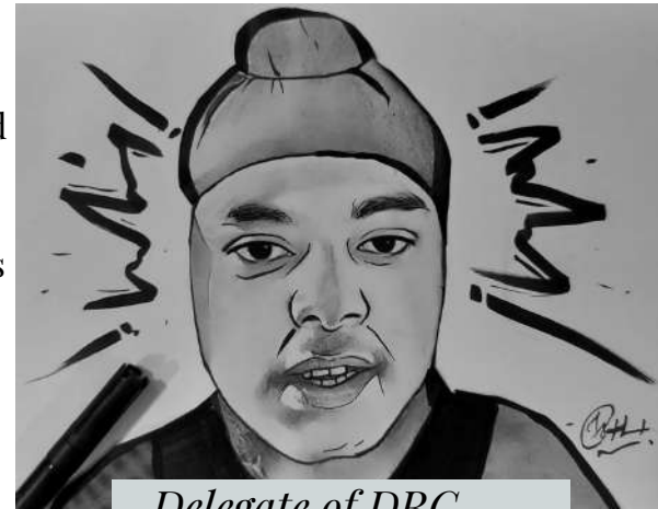
Delegate of DRC

The delegates were sent into different breakout rooms as double delegations. Thereafter, the delegates indulged into a heated discussion about the accountability of countries. Following this, the Chair called it a day for the committee.